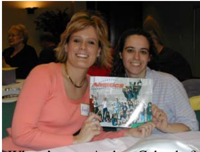
Where's your Ambuc Calendar?