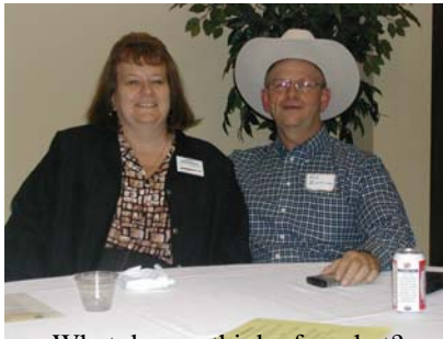
What do you think of my hat?