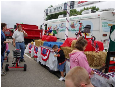
Getting the float ready to go

MOBILE DEMO SITE AT BEAVERCREEK CHAMBER CHAT SPONSORED BY CEMEX (SPLIT THE POT WAS DONATED TO GREENEBUCS).