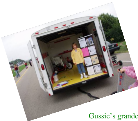
Gussie's grandchildren helping GreeneBucs out.