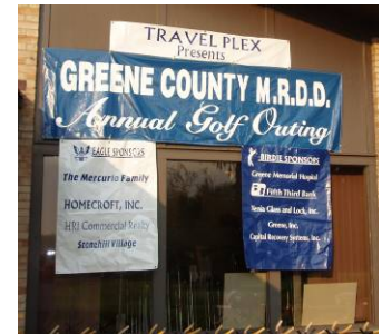
GreeneBucs members supports local MRDD Golf Outing