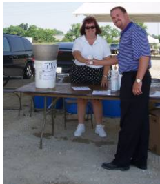
Sandy serves up refreshments to a Patron.

American Classic Cycles Sponsors Demo Site At their Saturday 17 Open House donations were made to purchase an AMTRYKE