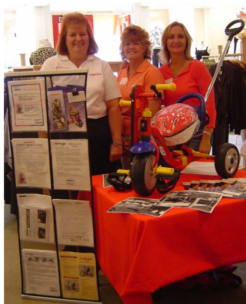
GreeneBucs volunteers display an informational booth about Ambucs , Amtrykes and Greenebucs at Talbot's in Oakwood