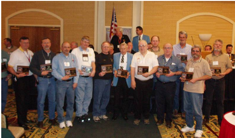
Representatives of Moose Lodges who made a donation for AMTRYKES between August and January received plaques from GreeneBucs.