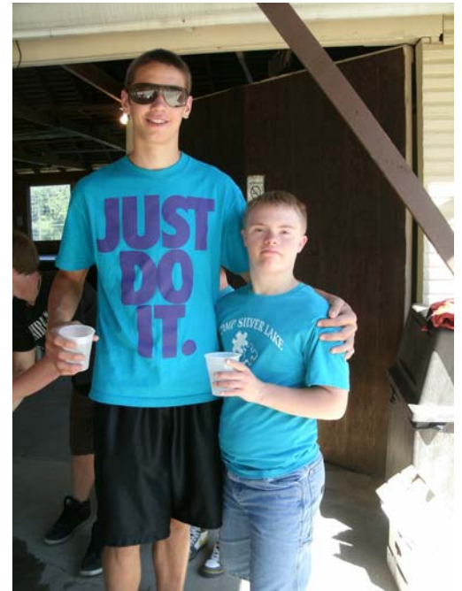
Camper sharing a cooling drink with an assistant.