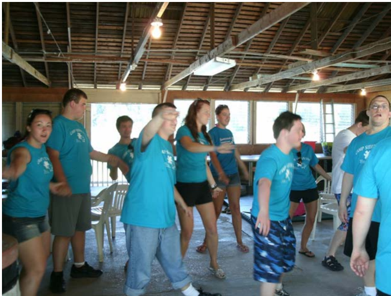
Campers surfing to surfing music