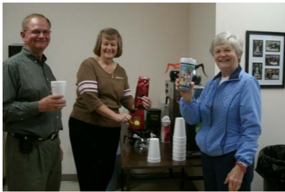
GreeneBucs members getting their “caffeine fix” before they start in on the training sessions