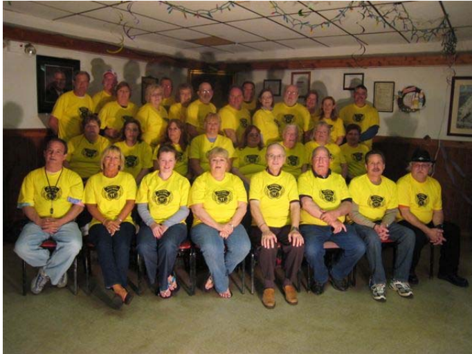
Featured-all the committee members who work hard throughout the year to have a successful Blessing of the Bikes.