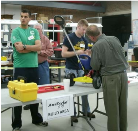
VOLUNTEER GROUP FROM WPAFB SUPPORTED THE MODERN WOODSMAN BENEFICIAL GROUP COMMUNITY DAY BY BUILDING AND REPAIRING AMPTRYKES