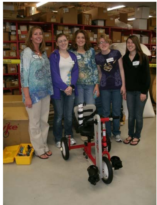
The “girl team” has completed their AMTRYKE