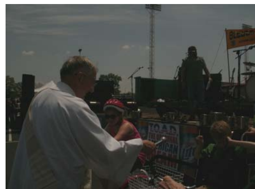
One of the priests blessing the new Trykes